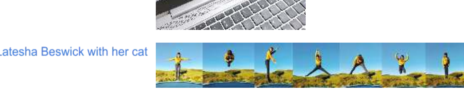
Imagen Earwaker spelling out 'TOKANUI' on her trampoline