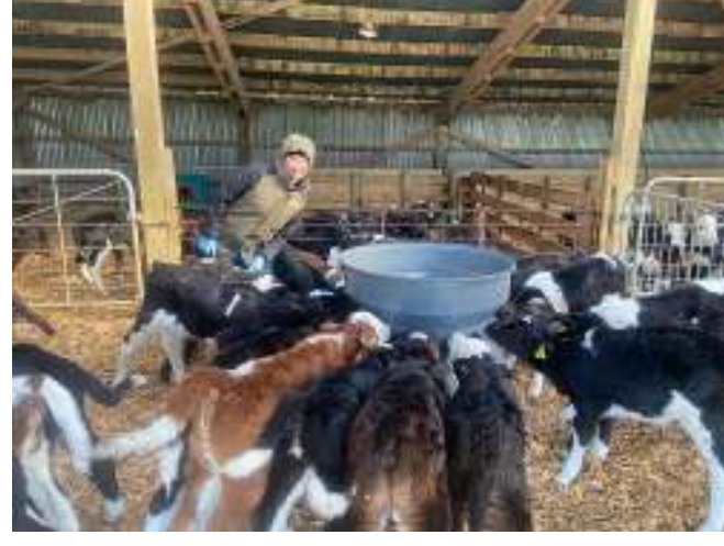
Ella Beswick helping out with calf feeding