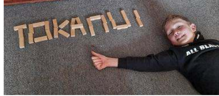
Jethro Coley used blocks to spell 'TOKANUI'