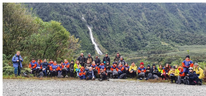
Our Deep Cove Campers