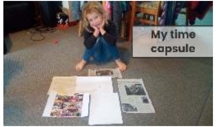
Honor's time capsule Team Kowhai