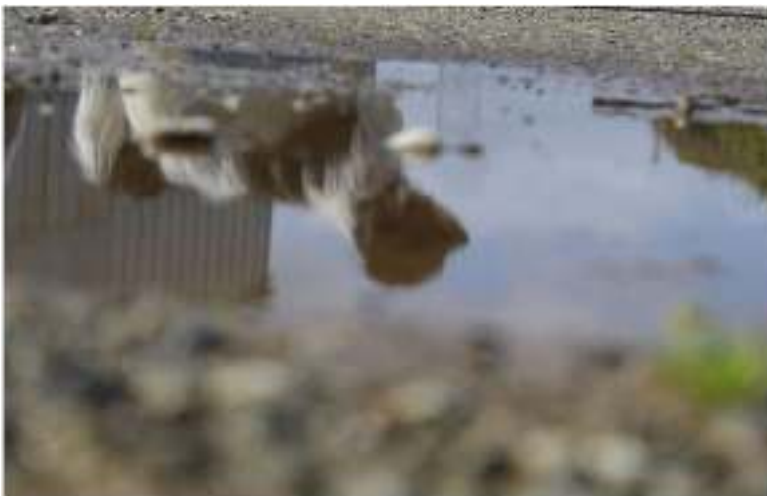
Photograph showing Reflection by Brooke Strang Team Papura