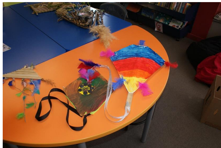
Kites for the Art Exhibition at Waikawa